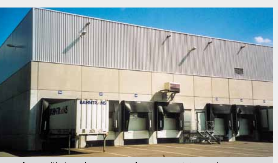
Uniform, well-balanced appearance after using KEIM Concretal-Lasur